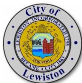
City of Lewiston